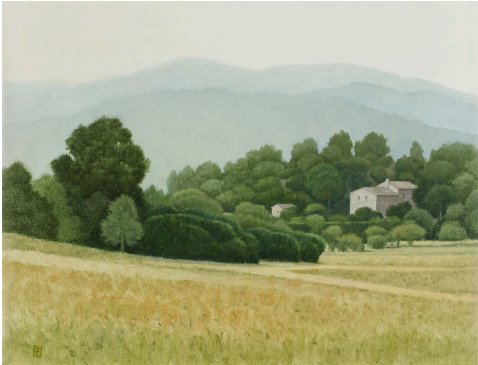
Landscape at Lourmarin, Provence 66 x 86.5 cm