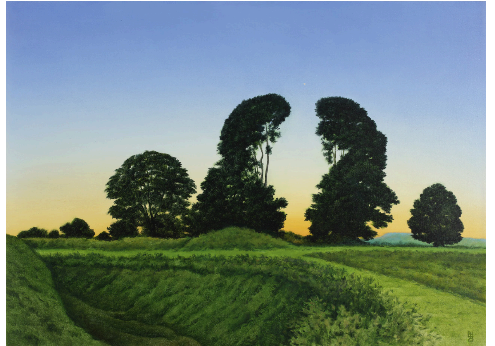
The Night Watch, Old Sarum 76.5 x 107 cm