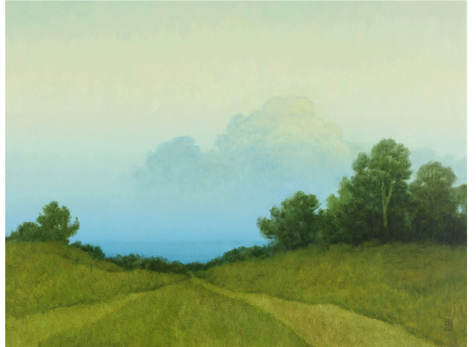
The Sea Beyond 76 x 101,5 cm