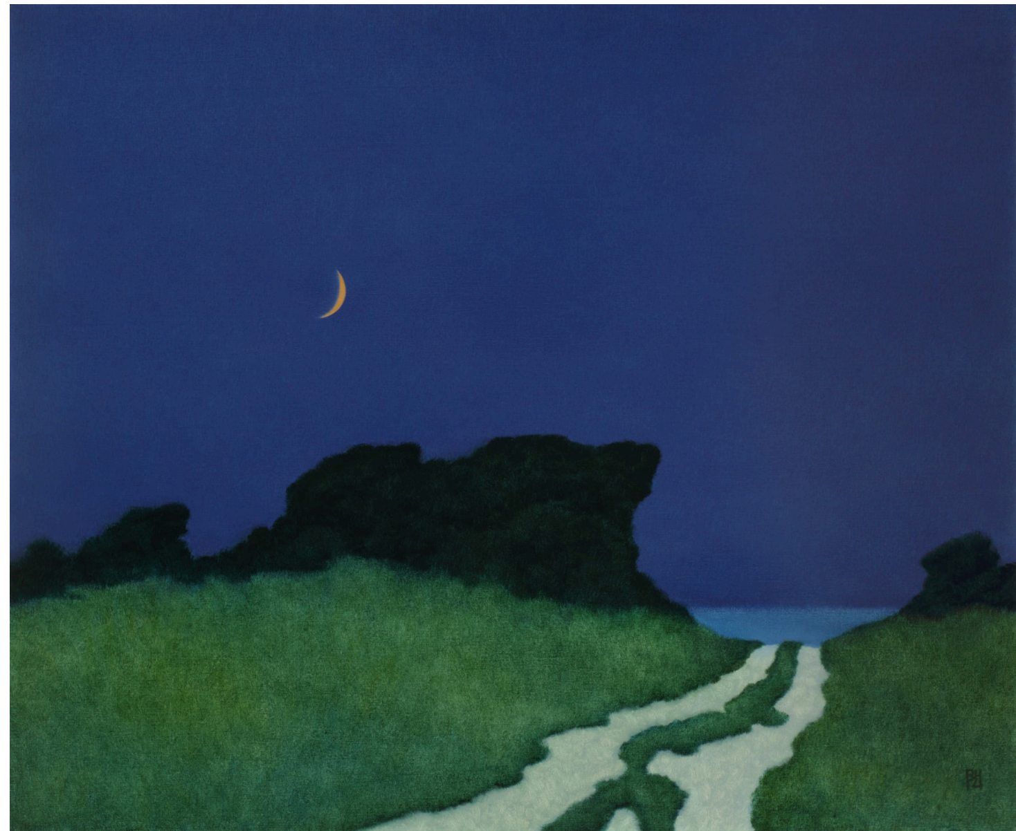
Sea path and moon 71 x 87 cm