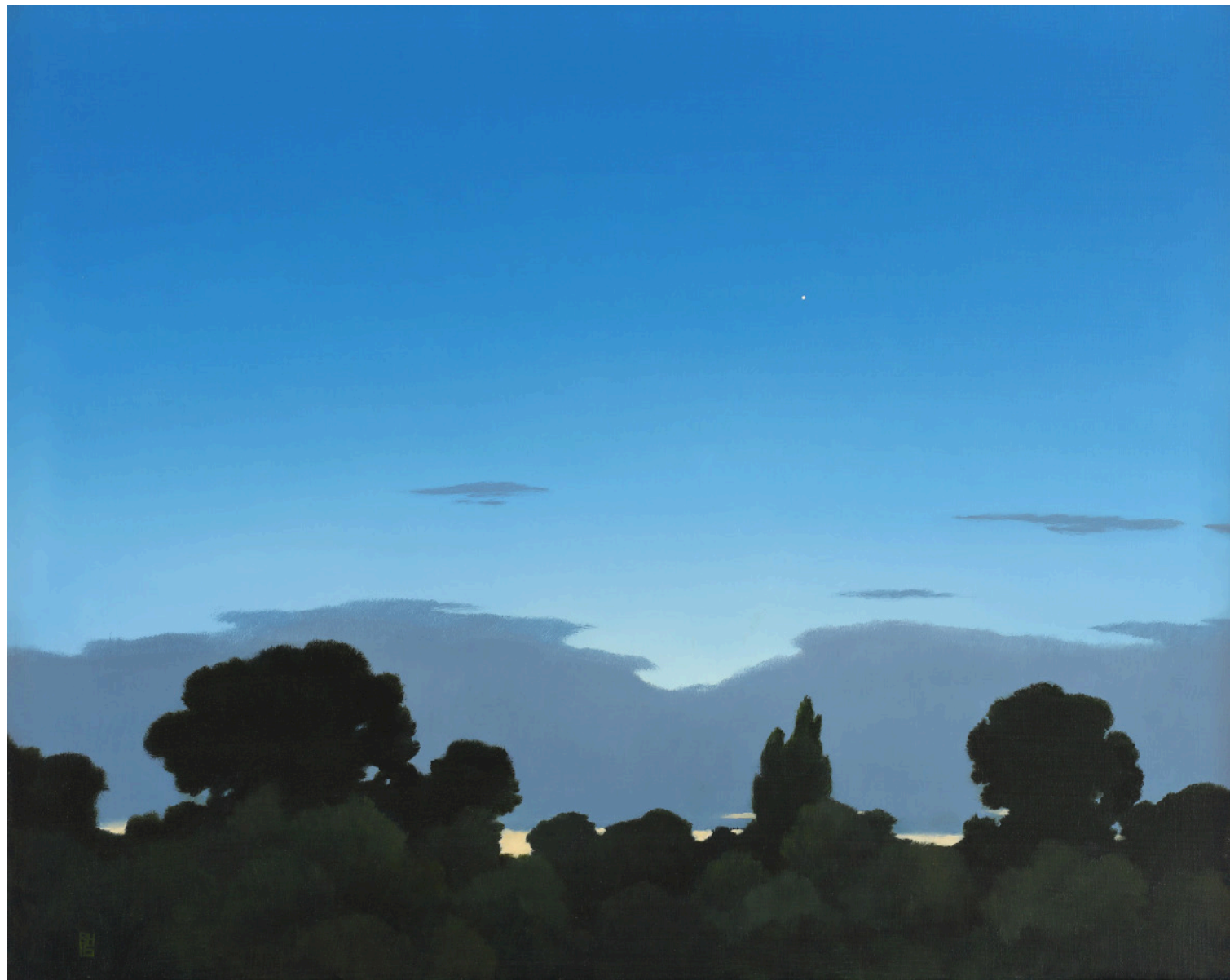
Daybreak 61 x 76 cm