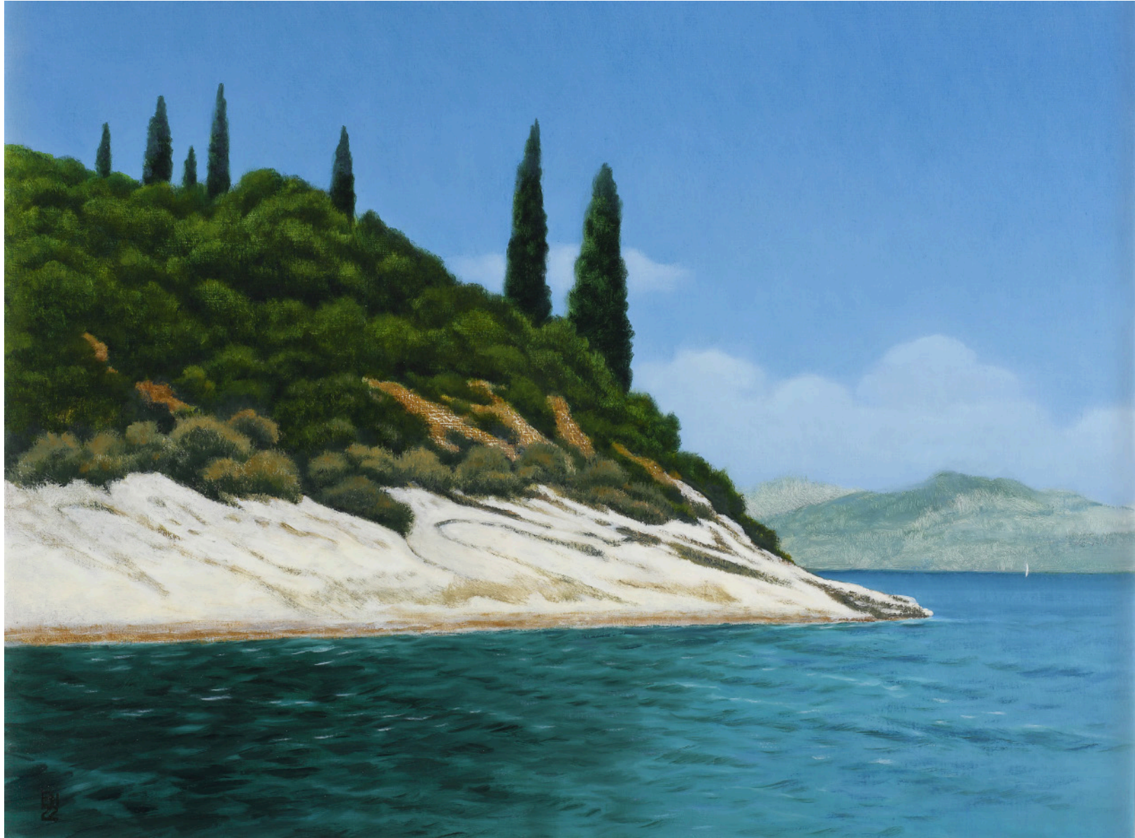
White Beach, Corfu 61 x 81 cm