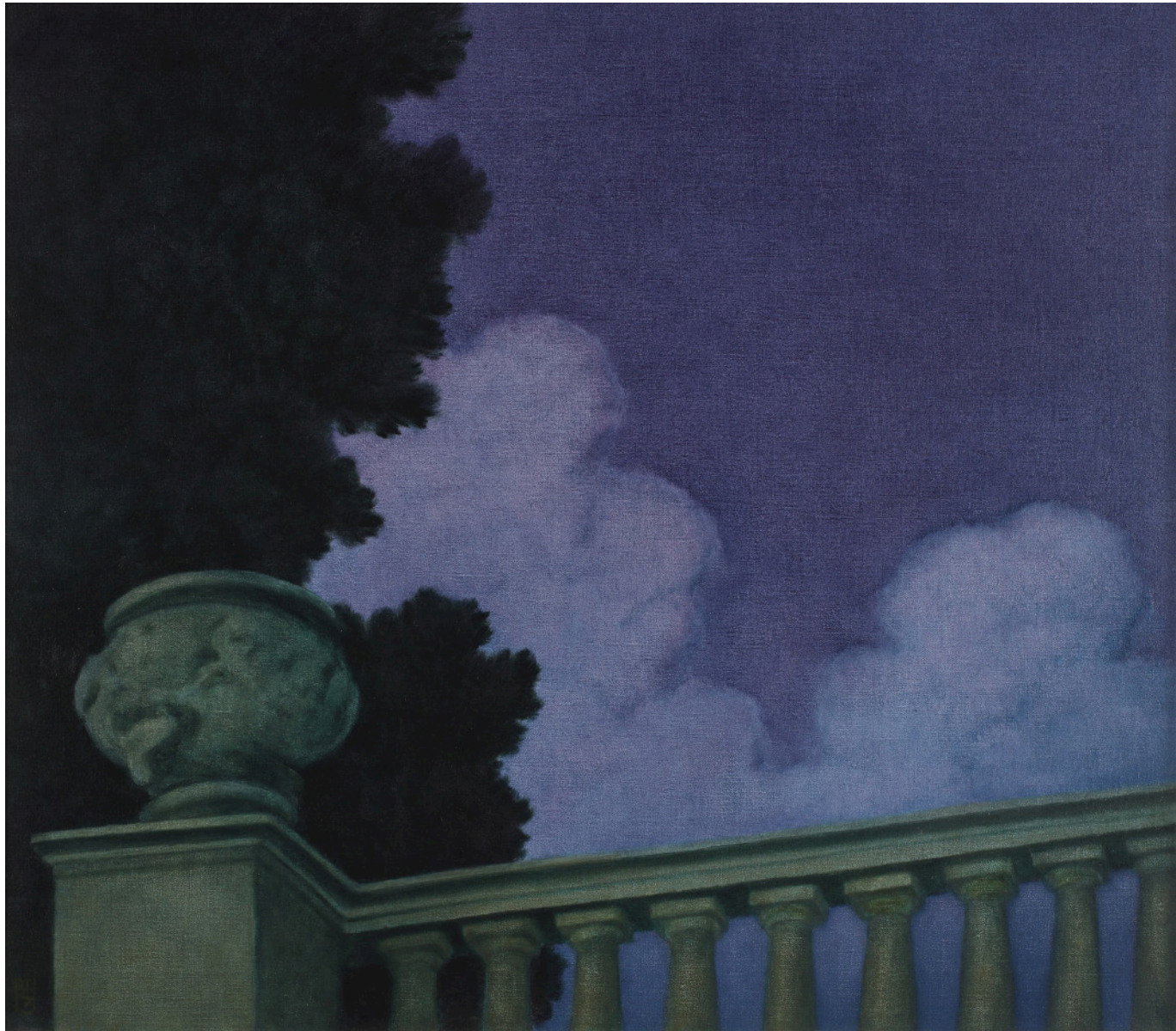
'La Superba', Summer Night, Genoa 71 x 81 cm