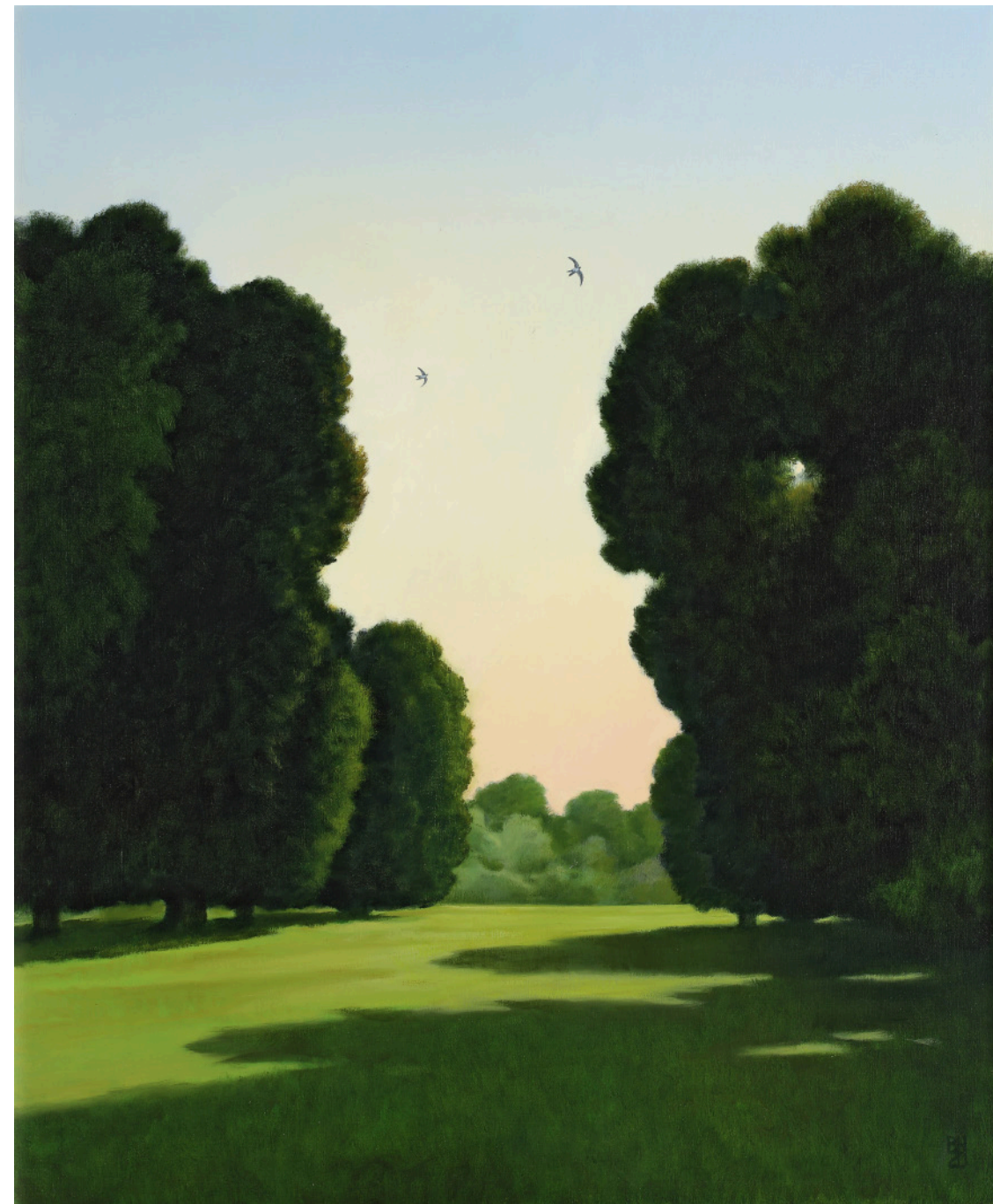
The Last of Summer, Kew Gardens 86 x 71 cm