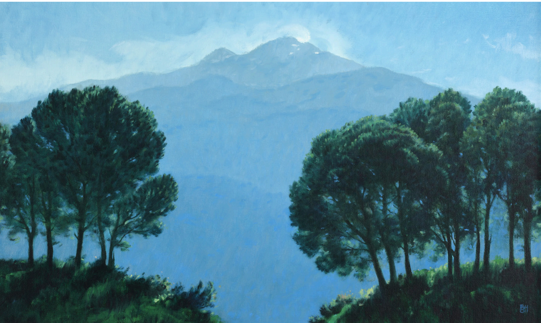
Pines with Mount Etna Beyond, Sicily 45 x 76 cm