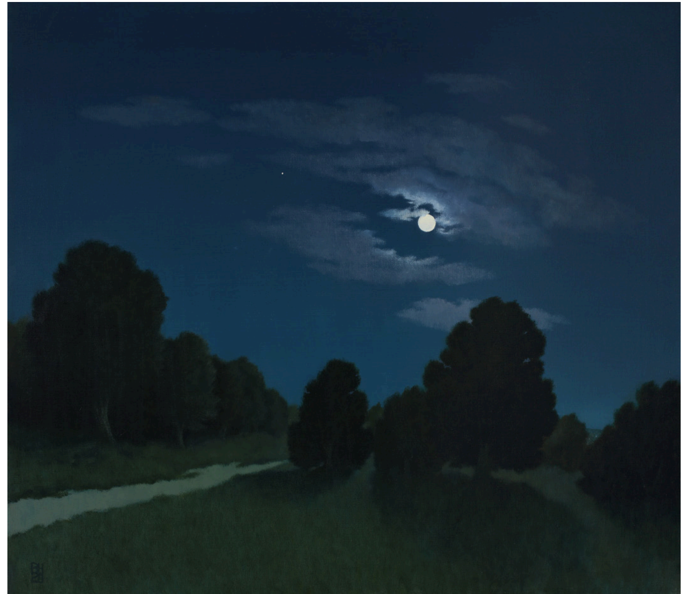
Moon over Siusi, Italy 76.5 x 86.5 cm