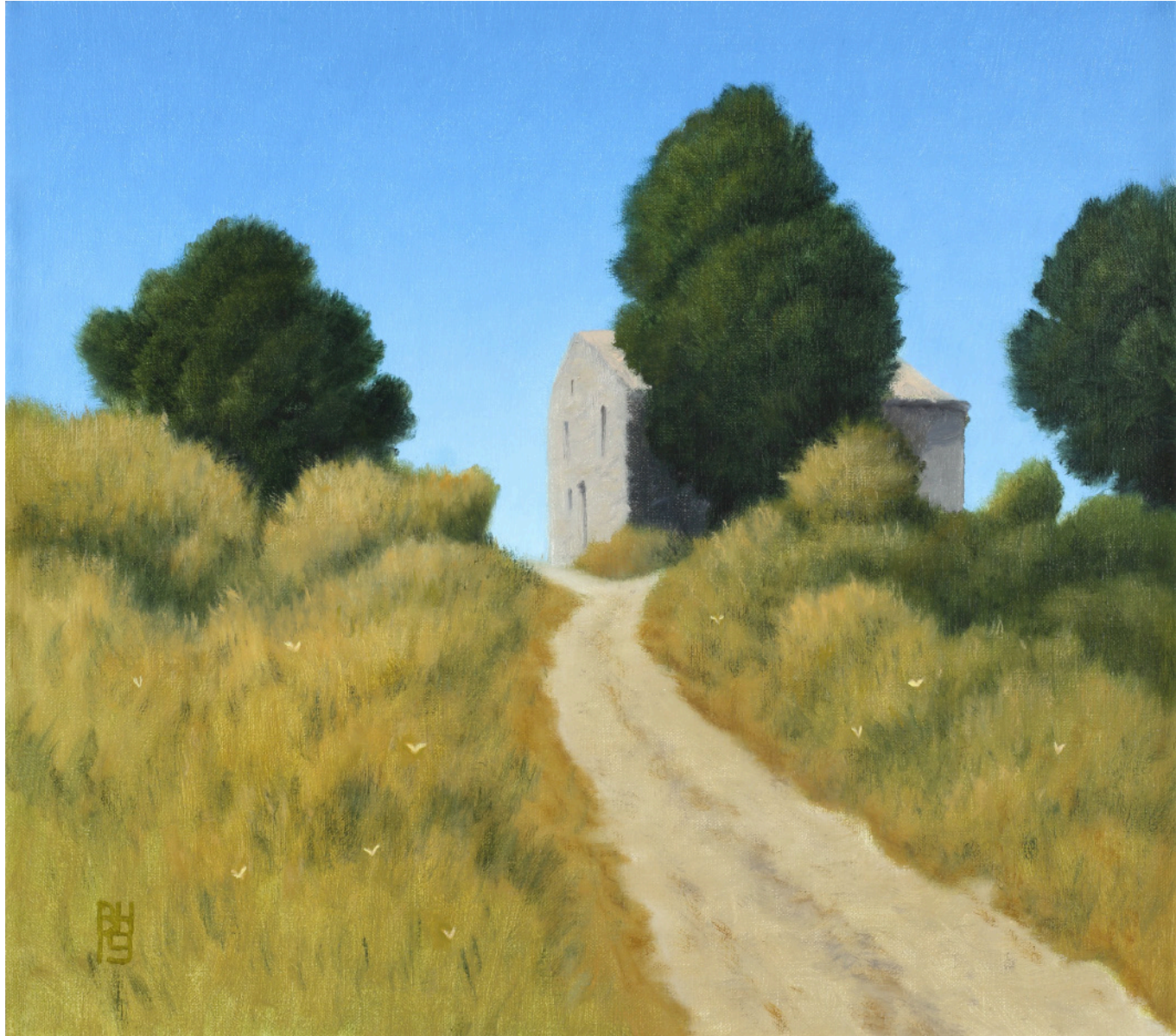
Old Perithia, Corfu 41 x 46 cm