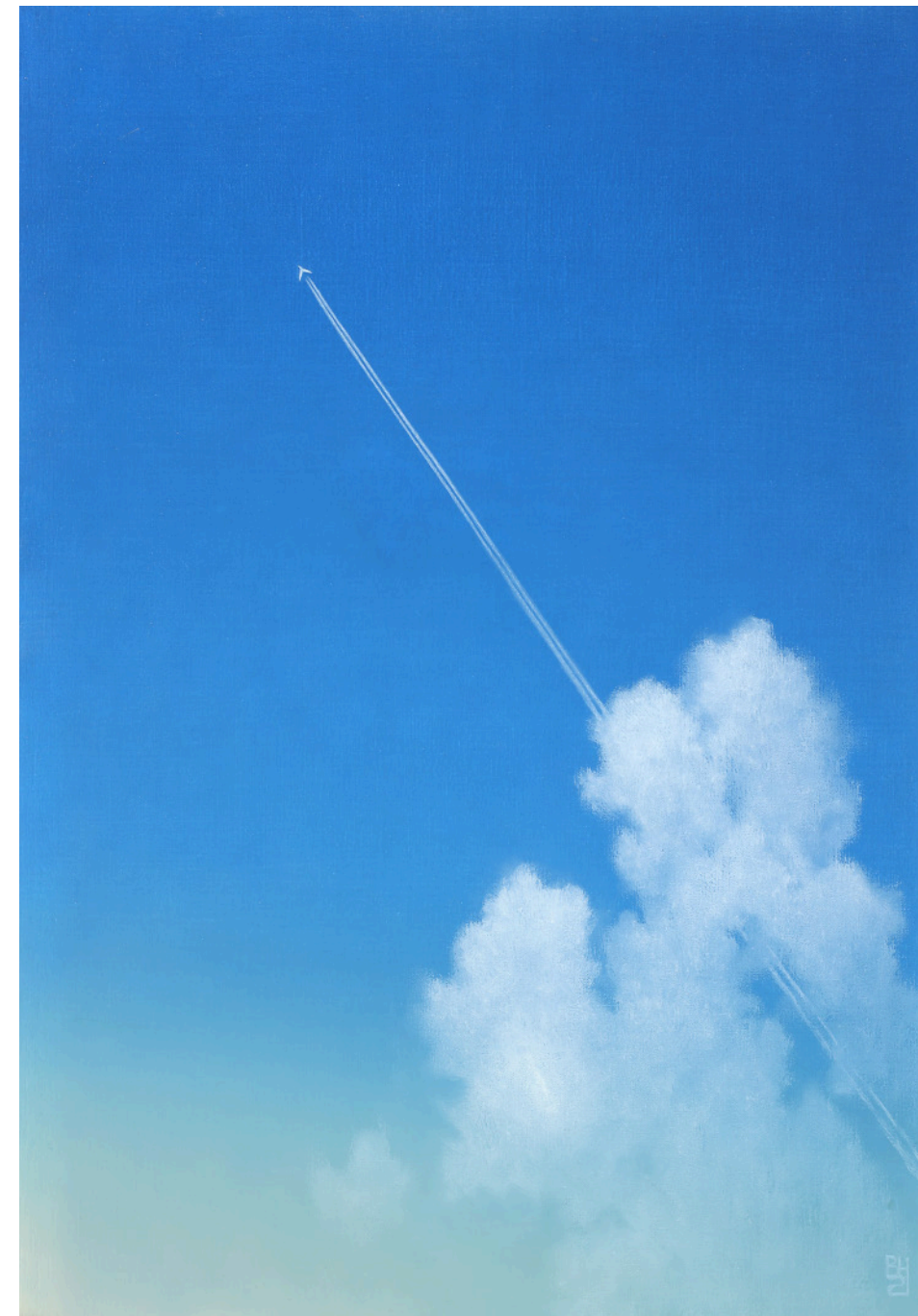
Away and Westward Bound 61 x 46 cm