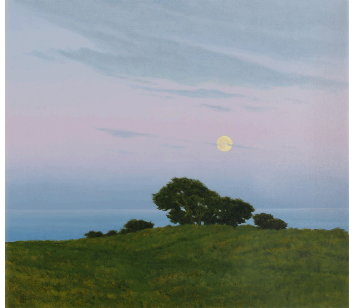
August Moon 82 x 91.5 cm