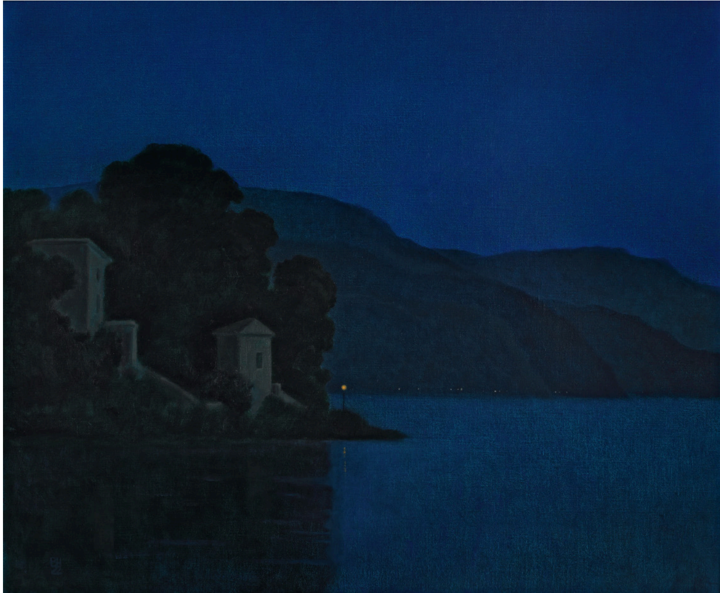
Italian Nocturne 71 x 86 cm