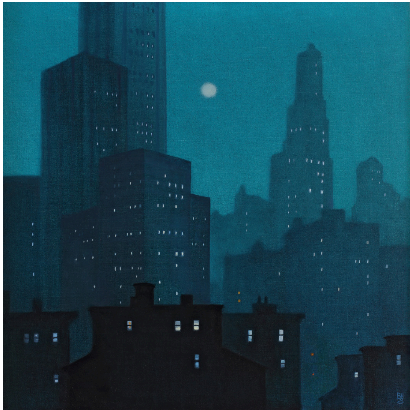
City Lights 76 x 76 cm