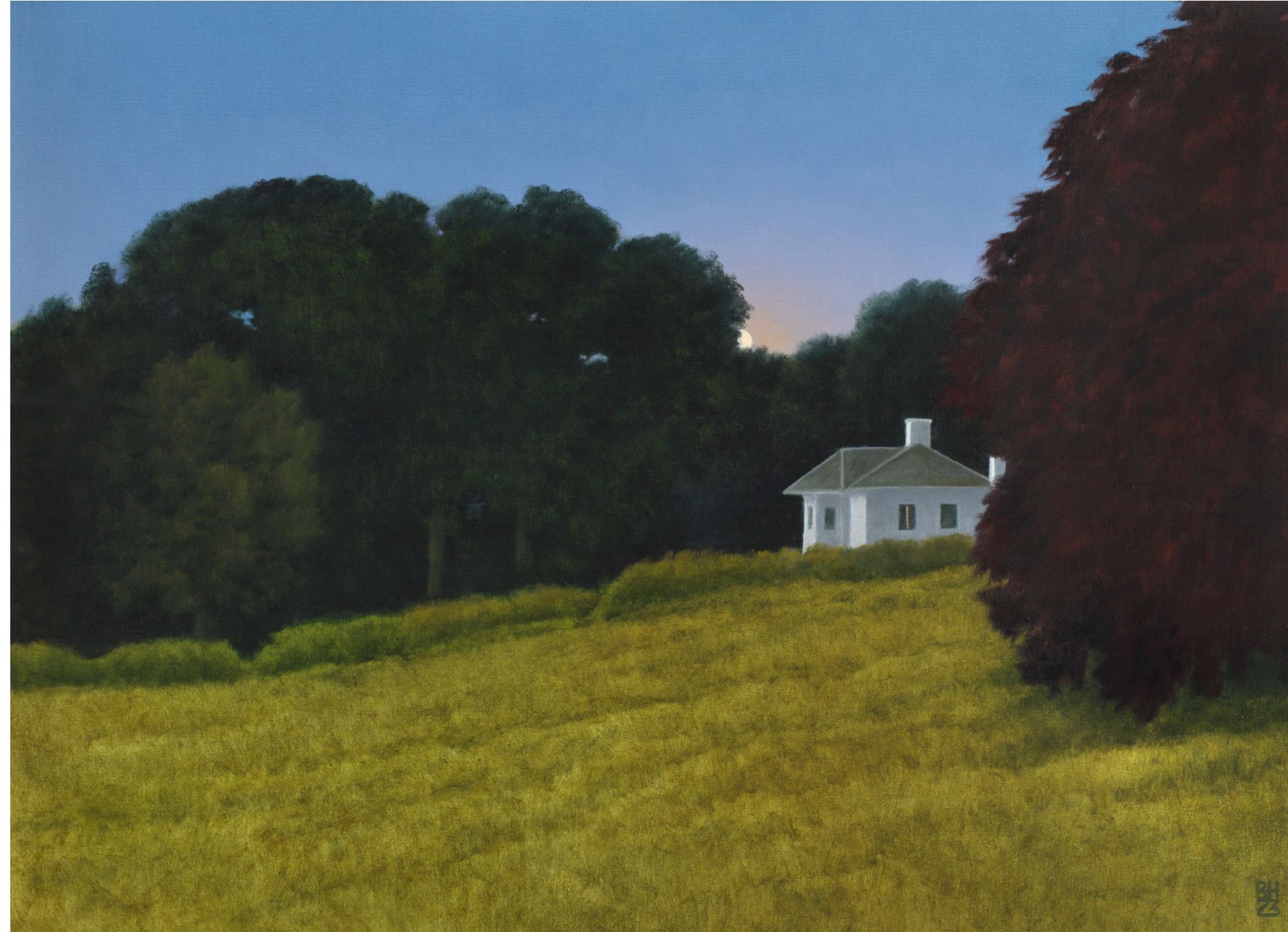
The White House, Hampstead Heath 66 x 91,5 cm