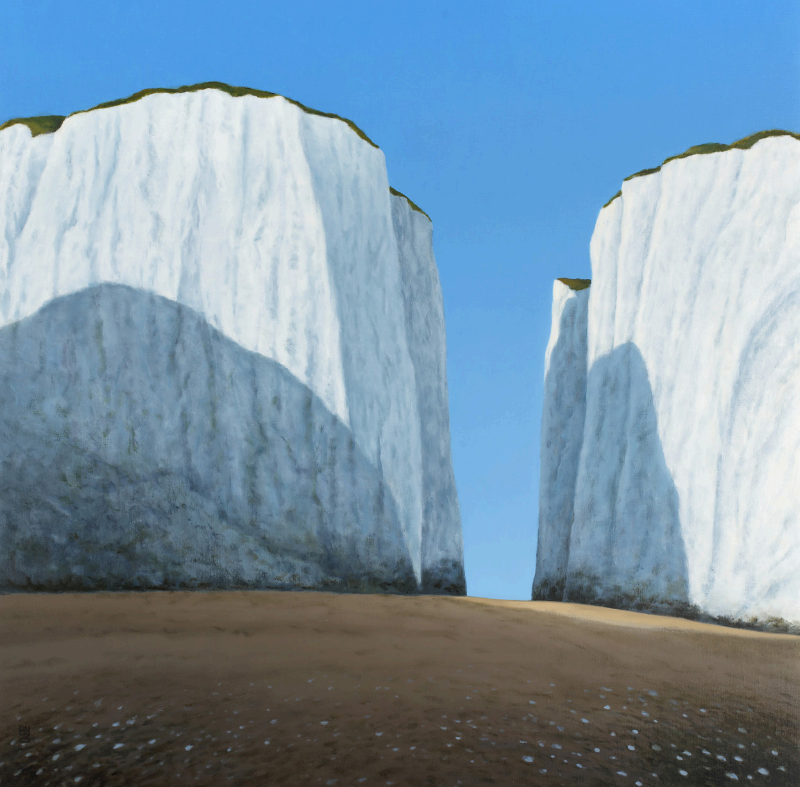
Chalk Valley, Botany Bay, Kent 102 x 102 cm