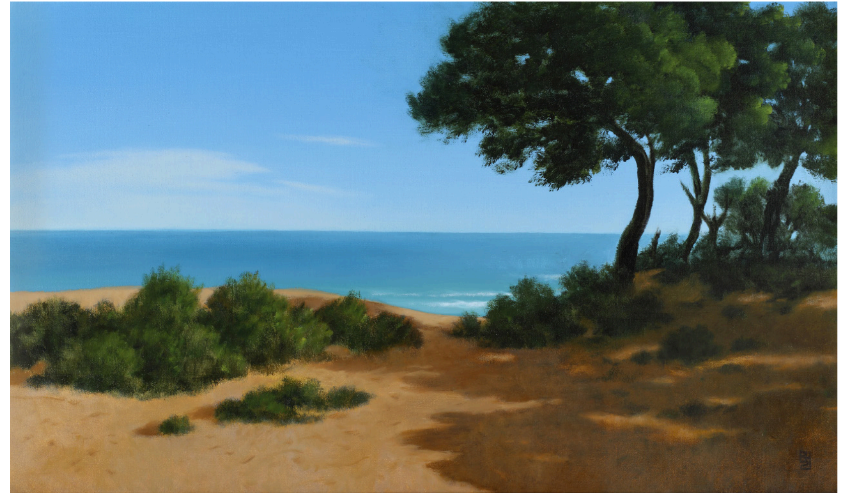
Castellabate, Italy 46 x 76 cm